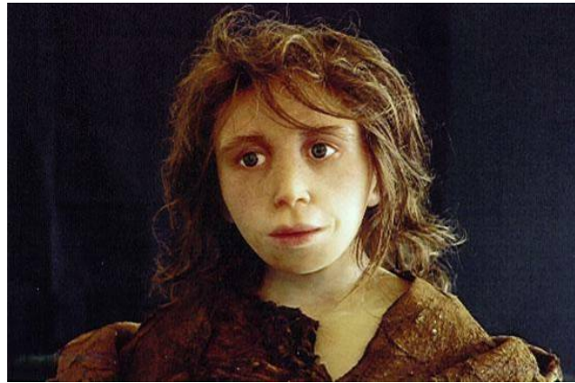
Gibraltar I: Reconstruction of a ca. four-year-old Neandertal PBS Neandertal (aka Homo neanderthalensis or Homo sapiens neanderthalensis ) Homo sapiens sapiens